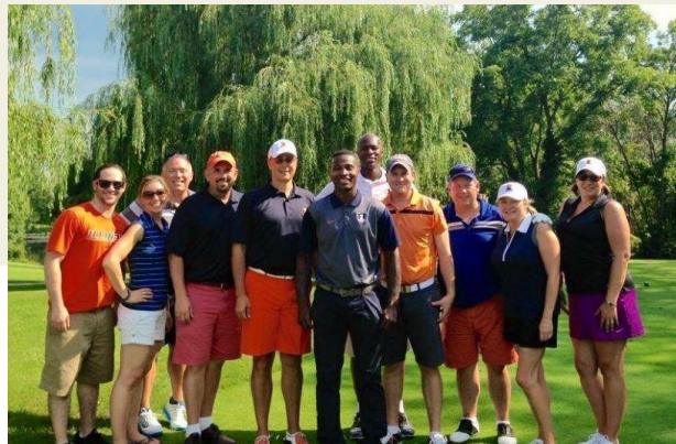
Chicago Illini Club soaking up the sun on Hole #5 at Seven Bridges Golf Club