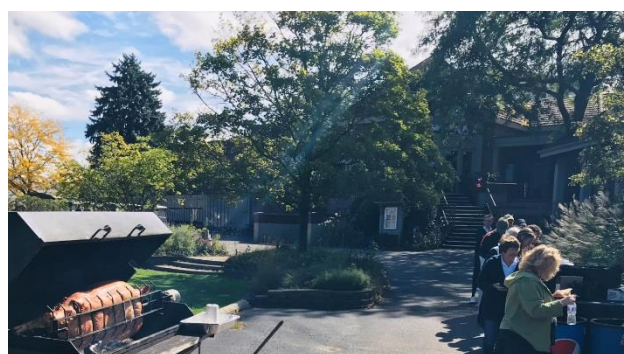
Chicago Scots Annual Kilted Classic enjoys a beautiful October day featuring our Famous Pig Roast dining experience.

Last season we debuted our new Golf Carts and Visage GPS Units at Seven Bridges Golf Club. The new carts feature comfortable bucket seats, USB charging ports, Interactive GPS units, and new safety features to enhance your golfing experience. Golfers offered positive feedback all season on the performance and quality of the GPS units and carts. The cart GPS is a great way to identify event sponsors during the round and provides an attention-grabbing canvas to give your valued sponsors even more exposure at your outing. The new addition of the USB charging ports on the carts provide a convenient way to keep your phone charged while golfing. No more stressing about missing an important call or draining your battery playing some soft tunes rolling down the fairway. Come join us in 2019 to see how these new features enhance your golfing experience and add value to you golf outings!