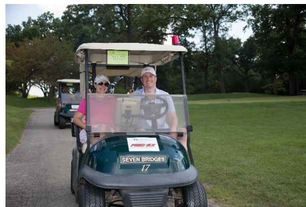
Illinois Medical District Guest House golfers tackling Hole #2