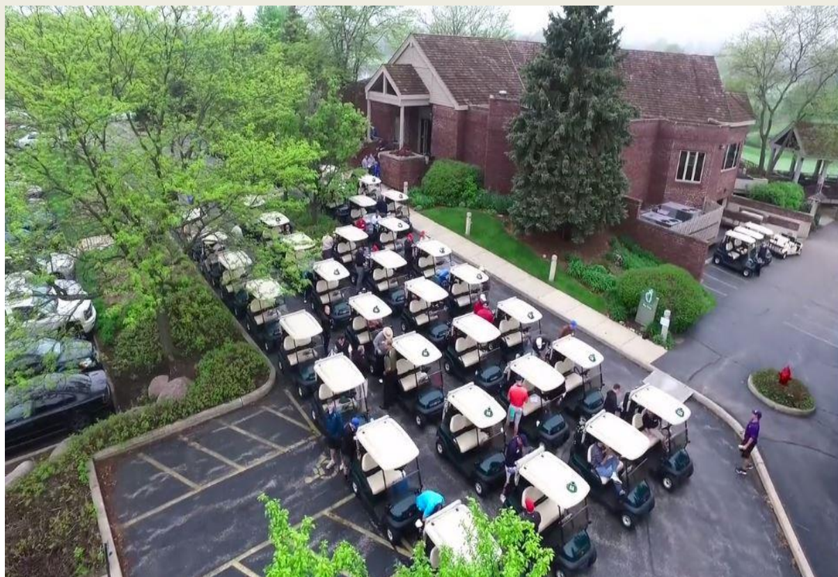
Seven Bridges Golf Club Staff gearing up for a morning tournament with Chicago Eagles Soccer.